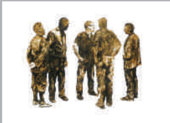
Painting studios • oil paintings and drawings printmaking studio • stone and plate lithography.