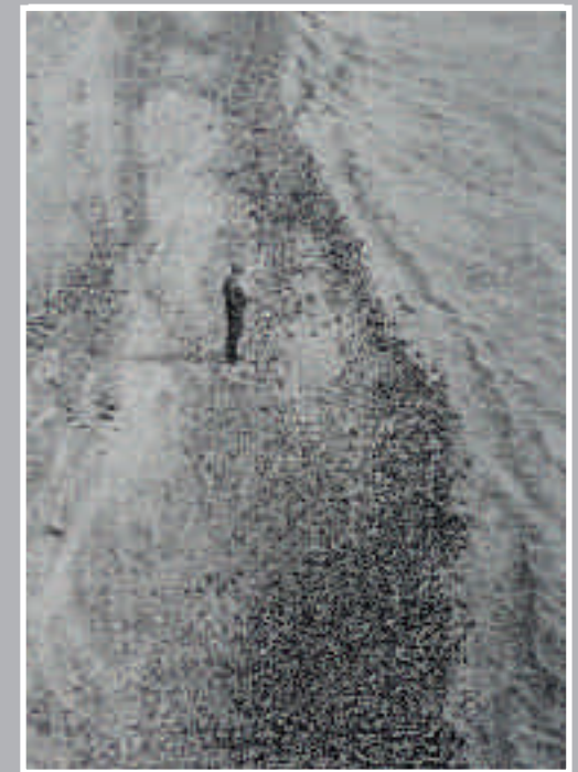
An opportunity to see work in progress, to view work on display, to browse, and also to buy directly from the studio.